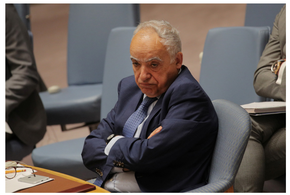
UN Libya envoy Ghassan Salamé attends a UN Security Council meeting in May 21, 2019, following weeks of intense conflict in and around Tripoli.

Should the violence escalate further and spread beyond Tripoli and its environs, the consequences would not just affect Libya but also its neighbors in Africa and Europe. An ever-growing governance gap in the country could see "Islamic State" militants, who have already begun waging an insurgency in the South-West, grow in strength. People smugglers too could step up their activities again, leading to rising numbers of migrants and refugees attempting the perilous journey across the Mediterranean.